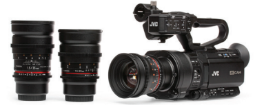
*Mount adaptor may be required. Adapters are available for PL, EF, Nikon, C, and other lenses.

When the camera is used with MFT, Super 16 and other size lenses, JVC's proprietary Variable Scan Mapping feature will maintain the lens's native angle of view. This gives filmmakers the flexibility of using widely available MFT lenses as well as high end cinema lenses. The unique combination of the MFT mount, the larger S35 image sensor and Variable Scan Mapping give the camera nearly limitless lens options.